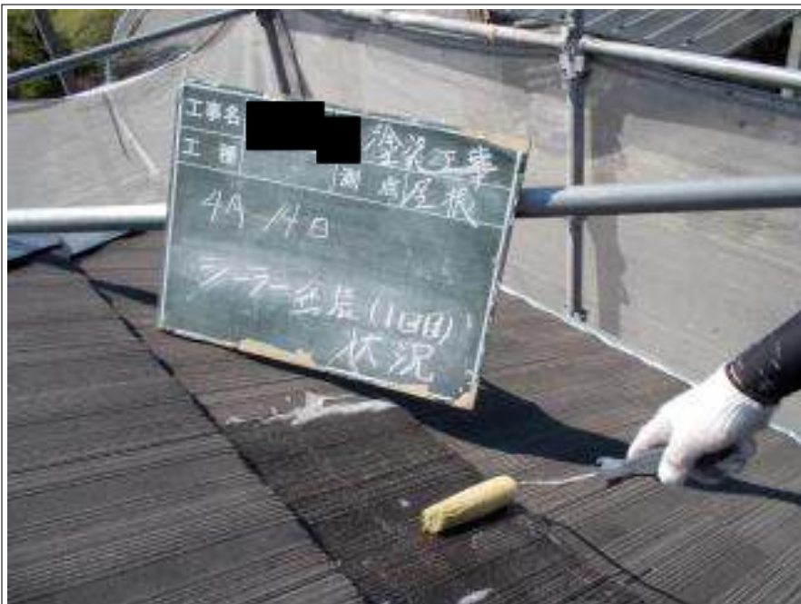
屋根下塗り塗装 1 回目施工中