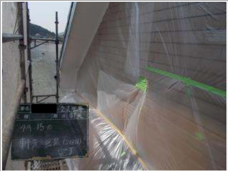
軒天塗装 2 回目施工完了