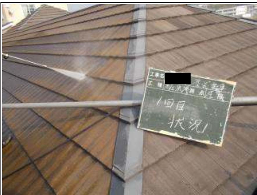
屋根高圧洗浄 1 回目施工中