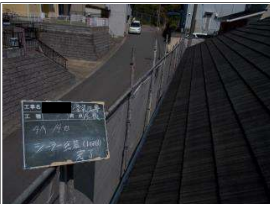
屋根下塗り塗装 1 回目施工完了