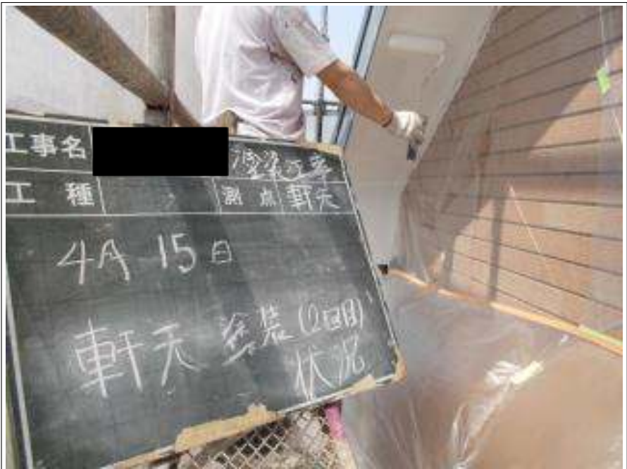
軒天塗装 2 回目施工中