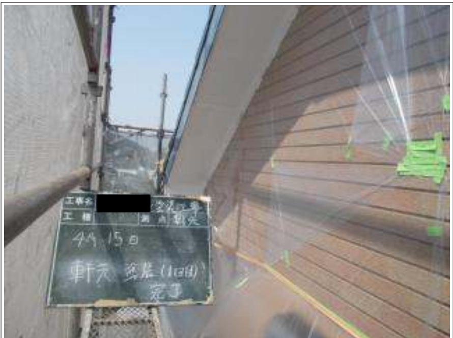
軒天塗装 1 回目施工完了