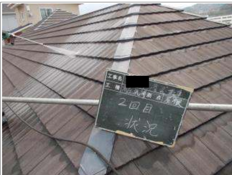
屋根高圧洗浄 2 回目施工中