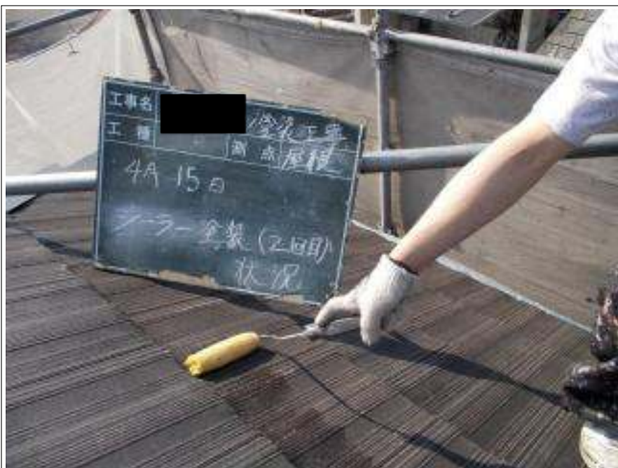
屋根下塗り塗装 2 回目施工中