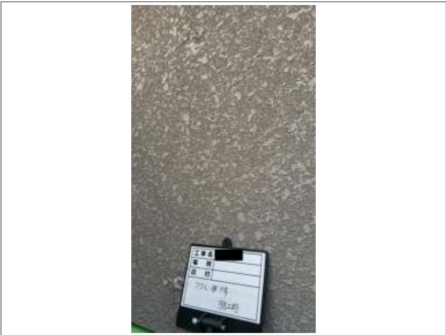
外壁 浮き部補修 施工前