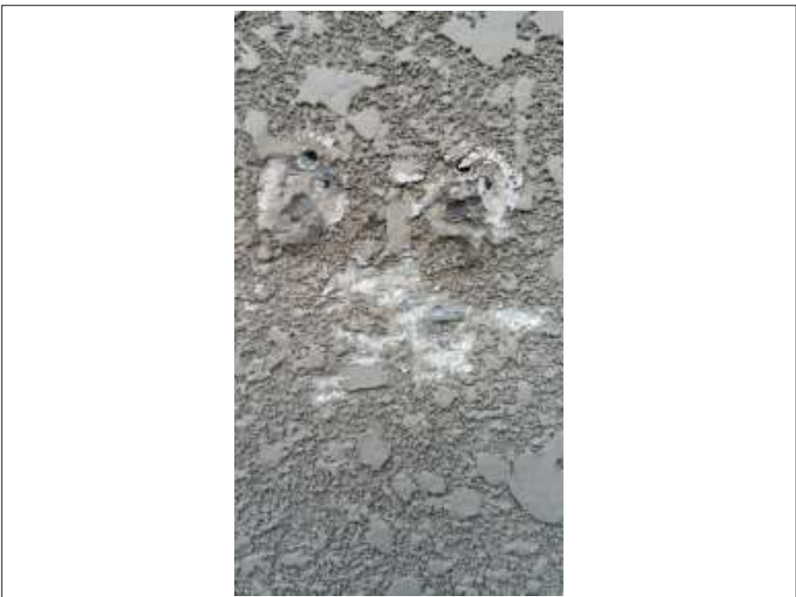
外壁 浮き部補修 施工前