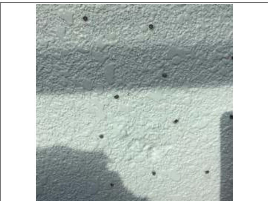
外壁 浮き部補修 施工中