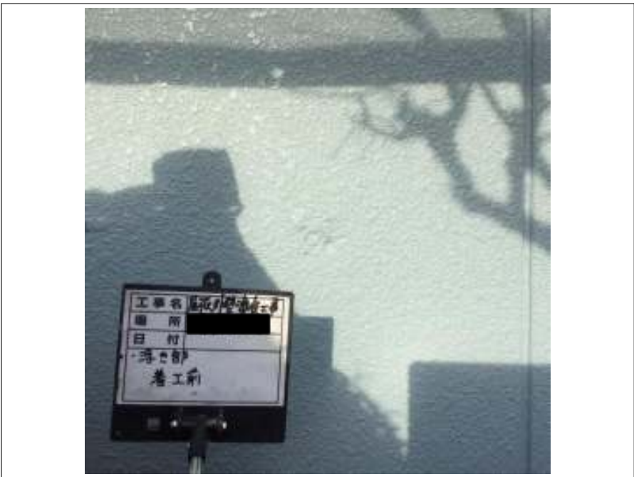
外壁 浮き部補修 施工前