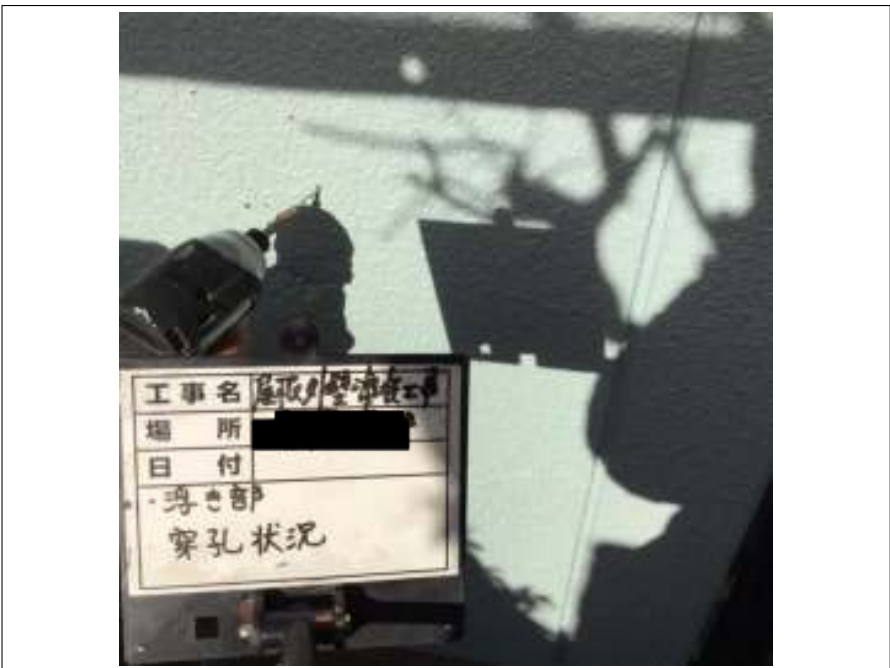
外壁 浮き部補修 施工中